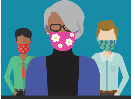
When in public, wear a cloth face covering over your nose and mouth.