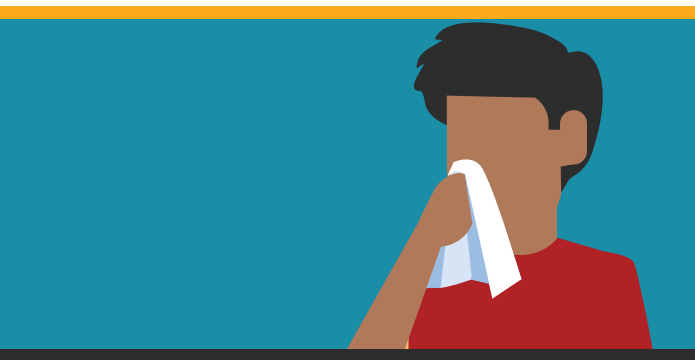
Cover your cough or sneeze with a tissue, then throw the tissue in the trash and wash your hands.

Stay at least 6 feet (about 2 arms' length) from other people.