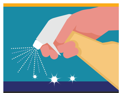
Clean and disinfect frequently touched objects and surfaces.